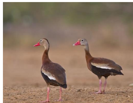
Black-tailed Whistling Duck