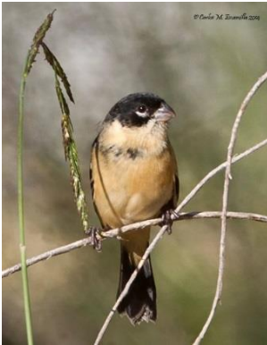
Morelet's Seedeater formerly known as White-collared Seedeater

To view more photos, please visit the Laredo Birding Festival and Monte Mucho Audbon Society Facebook pages, as well as laredobirdingfestival.org , allaboutbirds.org , ebird.org , birdsoftheworld.org , and facebook.com/raul.delaredo1 .